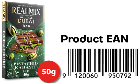
PISTACHIO KADAYIF CHOCOLATE